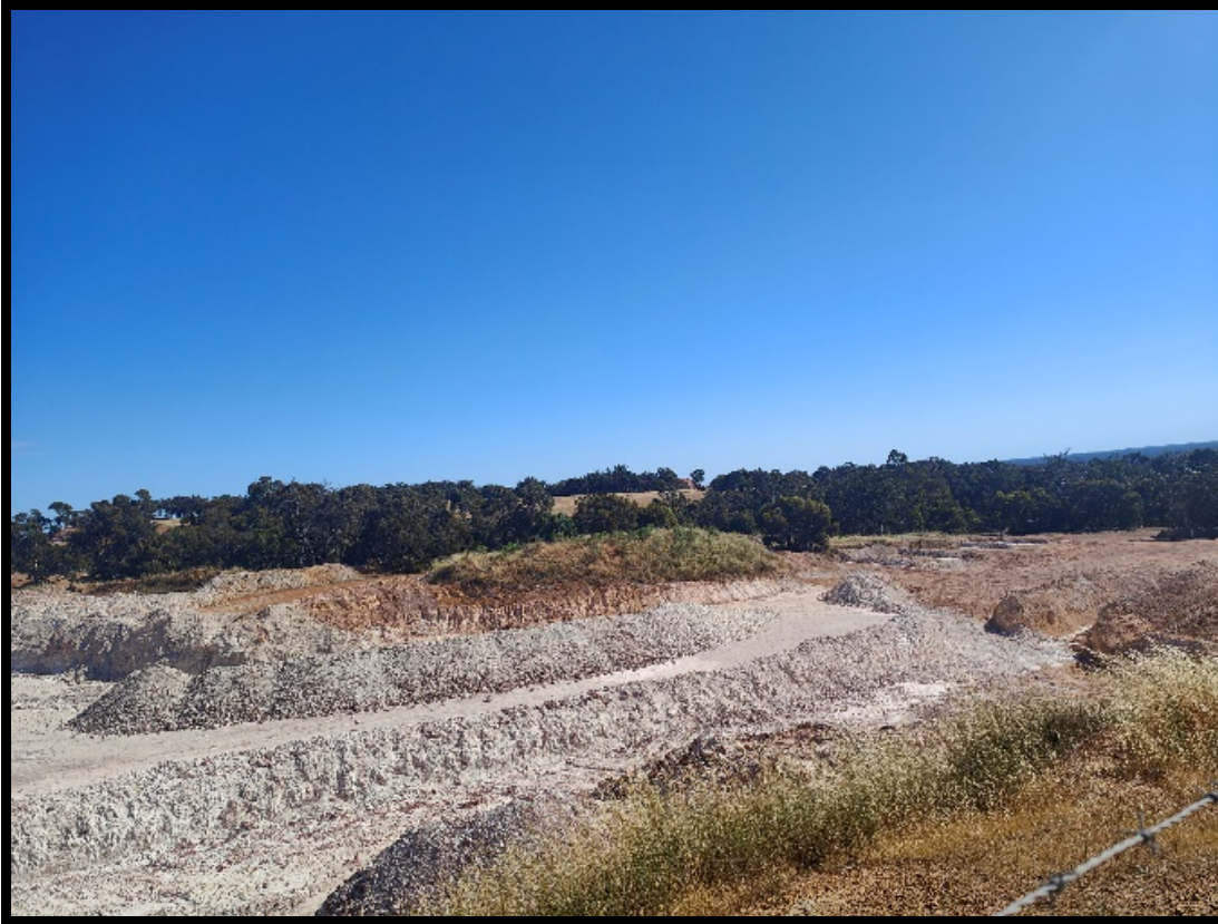
Photo 1: Proposed site as viewed from Shire landfill site looking south-west.