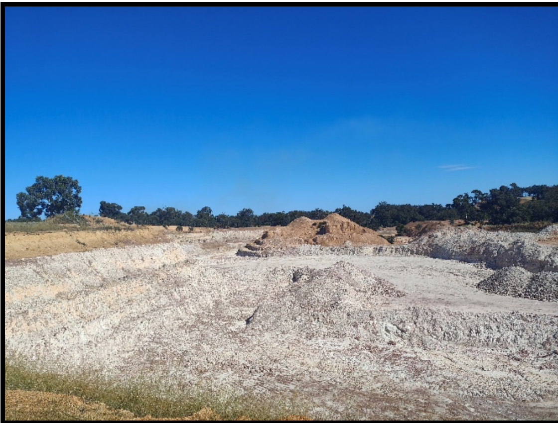
Photo 2: Proposed site as viewed from Shire landfill site looking south.