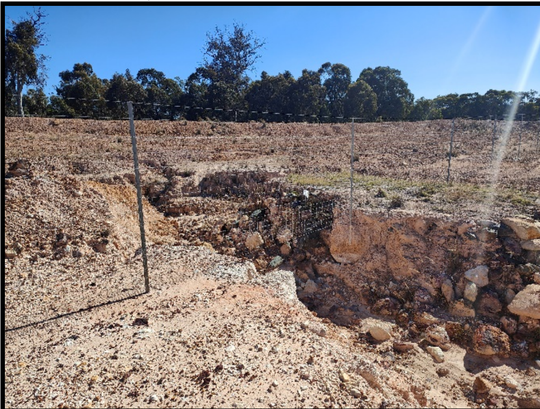
Photo 4: Stormwater channel flowing from Lot 9001 to the Shire's Muchea landfill site.