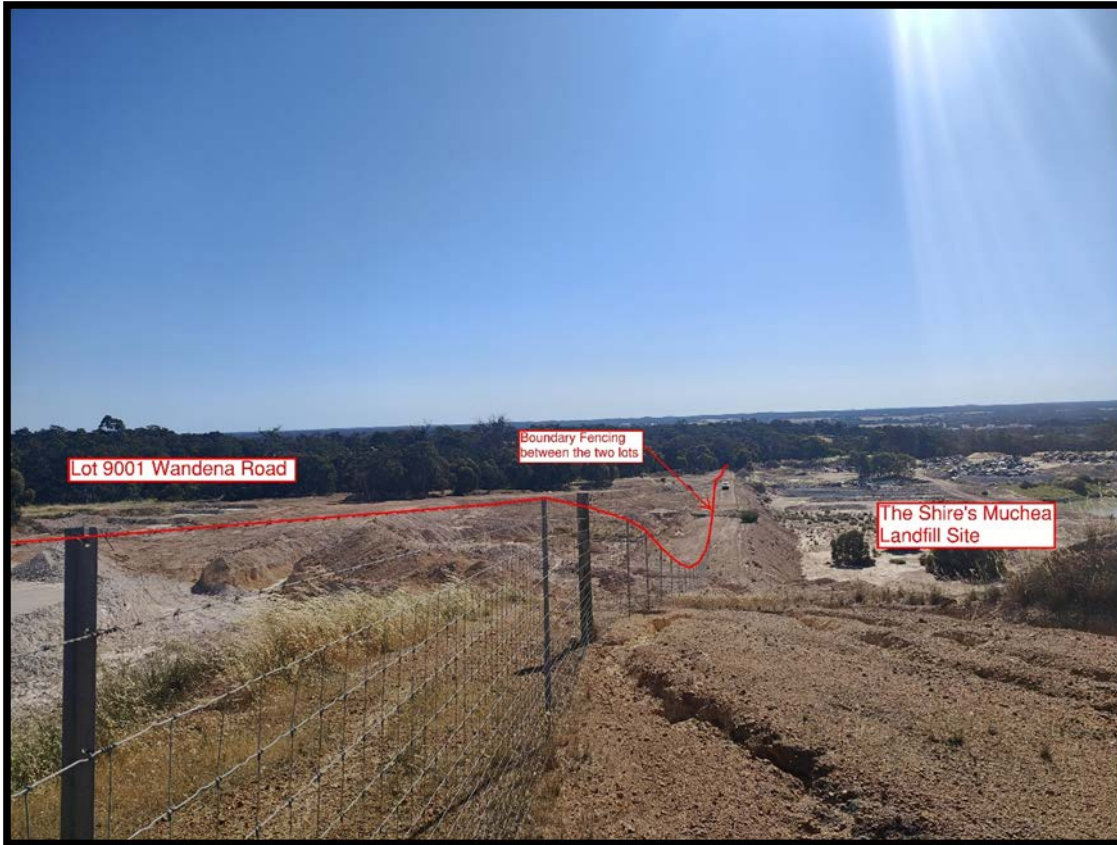
Photo 3: Shared boundary fence between Lot 9001 and the Shire's Muchea Landfill site.