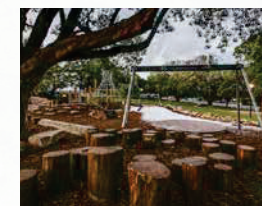
Example: Braithwaite Nature Play Park